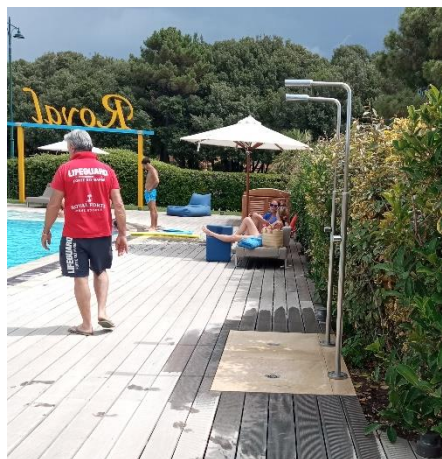
Floor-level pool showers